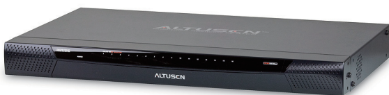
KN1116v front view